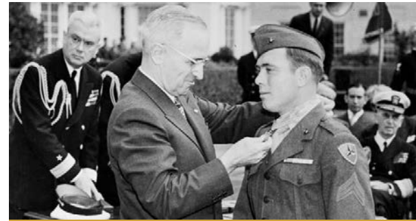
With Harry S. Truman on Oct 5, 1945

HERSHEL "WOODY" WILLIAMS' devotion to veterans and their families began before he entered the Marine Corps. Woody delivered Western Union telegrams informing families of the death of their loved one. He noted that "recognition of the families of those lost in military service was very inadequate."